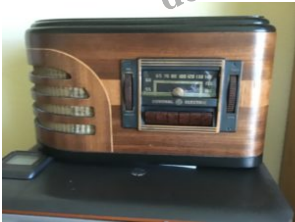
GE Model H624