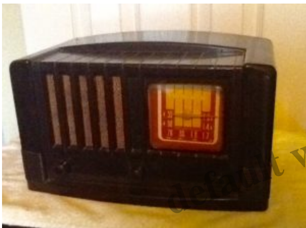
Stromberg Carlson model 761