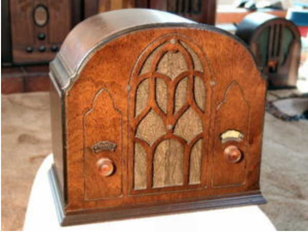
Majestic model 371