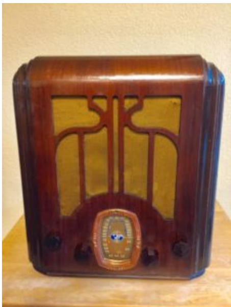
Crosley model 516