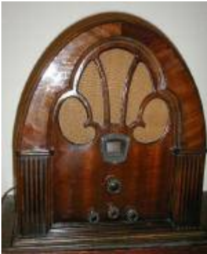
Philco model 70