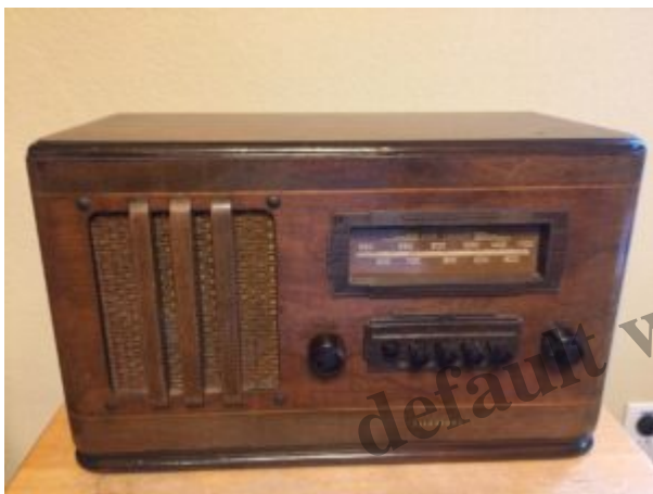
FIRESTONE MODEL 742727