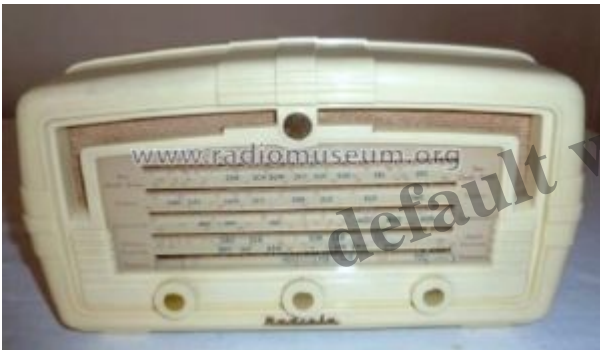
Aus. Radiola model 467