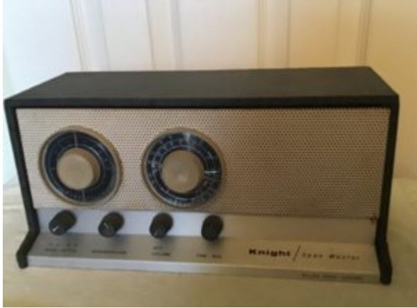
Knight Kit Space Master