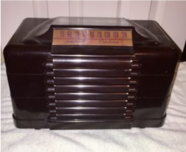
Satchell Carlson "Frog Eyes" model 146