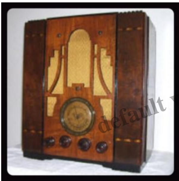
Atwater Kent 145