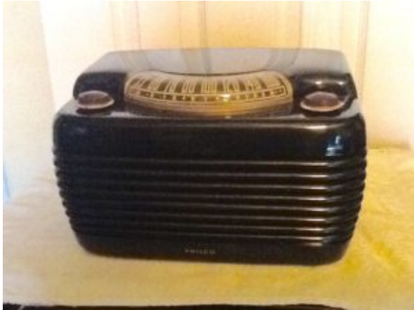
Philco model 46-424