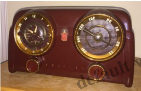
Crosley model D-25