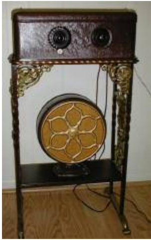
ATWATER KENT MODEL 37