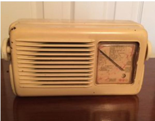
Radiomarelli model 9U65F