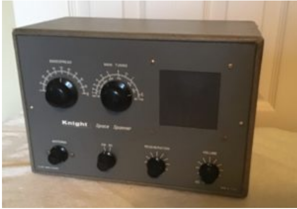
Knight Kit Space Spanner