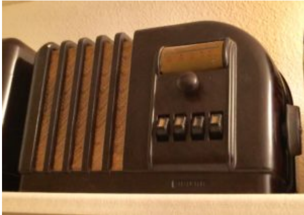
Airline model 93BR-508A