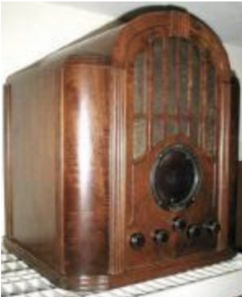
RCA MODEL 143