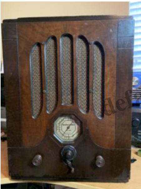
Stromberg Carlson 61T