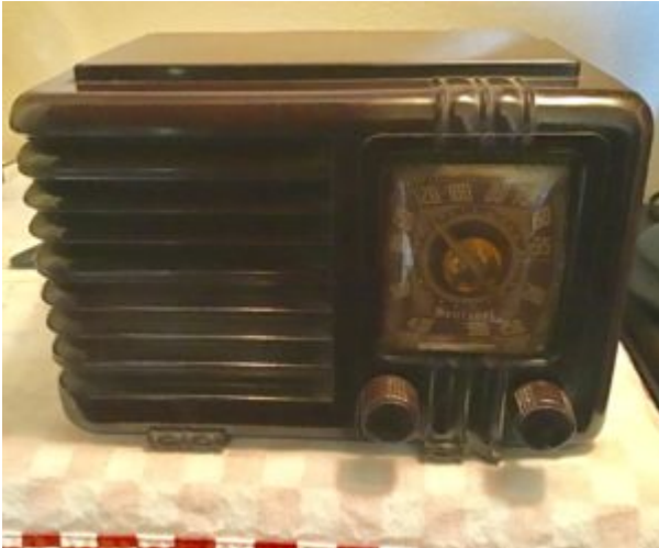
Sentinel model 226