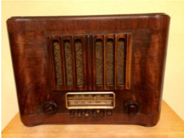
RCA Model 348D