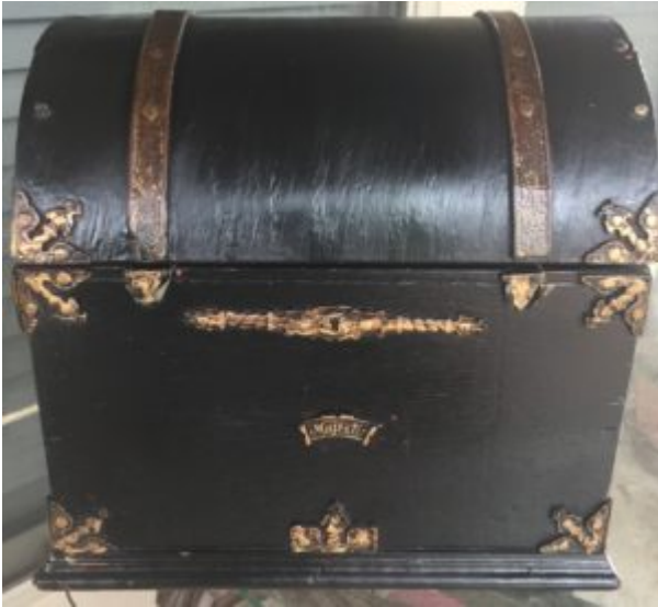
Majestic Treasure Chest 381